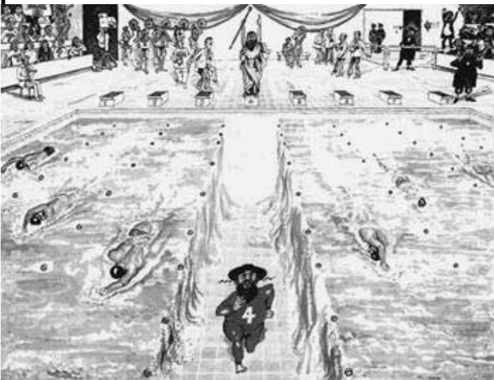
Jewish Olympic Swimmer

THERE ARE SOME QUESTIONS THAT CAN'T BE ANSWERED BY GOOGLE.