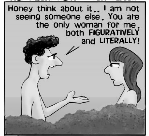
Even before the phrase 'boys will be boys' was possible, Eve had a difficult time believing Adam was really just takiing a walk in the Garden.