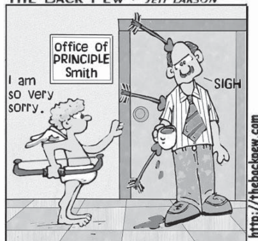
VALENTINES DAY at Euphoria Elementary got out of hand resulting in the suspension of 'Cupid' for violating the .. No Weapons policy, .. the Dress Code, and .. his candy hearts were deemed to be a controlled substance (sugar).