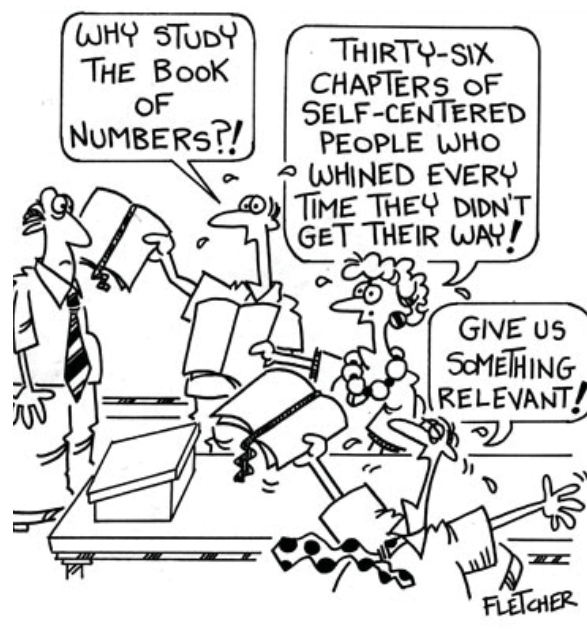
Cartoonist: Fletcher 2009 Christianity Today International/BuildingChurchLeaders.com. Used with permission

Check it out... might be of interest to you. ... www.ambassadorsinministry.org .